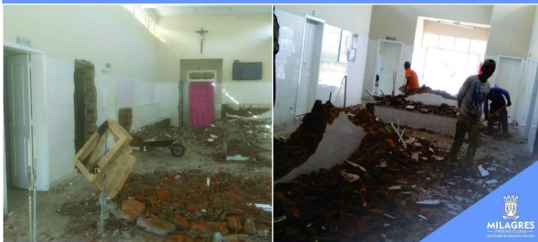
Figura 4 - Reforma do Hospital Municipal de Milagres.