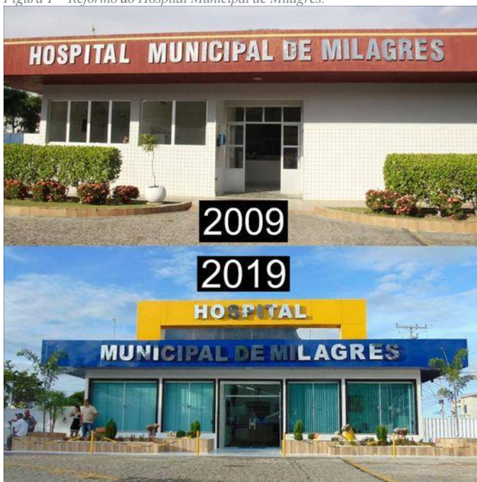
Figura 2 - Reforma do Hospital Municipal de Milagres ANTES X DEPOIS