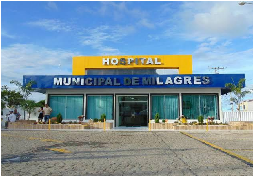
Figura 1 - Reforma do Hospital Municipal de Milagres.