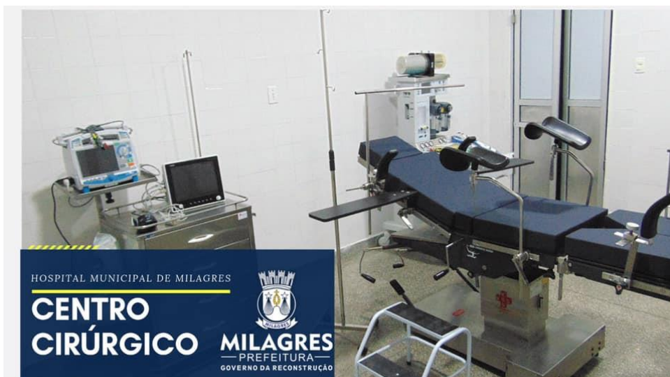
Figura 5 - Reforma do Hospital Municipal de Milagres.